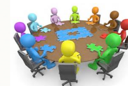
Action teams, new inventories and infrastructure