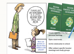
Advancements in education vs. memories and skills of families