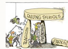
Who is responsible for education?