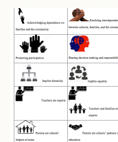
Partnerships vs. Engagement

An engaging keynote presentation brings forward the emerging need for partnerships and makes your staff re-evaluate how partnerships differ from traditional engagement. The focus is on the Mindset of Partnerships and existing barriers: hidden beliefs and assumptions about families in education, expertise, control, and erosion of trust. Interactive format will allow participants to pause, think, and discuss their thoughts with colleagues for an important paradigm shift. Keynote is tailored to your schools' specific needs and generally requires a 1 to 1.5 hour time frame.