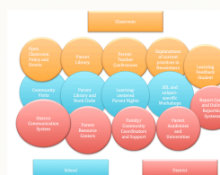
Connecting learning environments

Administrators/ Action Team: Cultural forces; Partnering with a PTA/O; Decision making and control; Building collaboration; Re-thinking policies and structures; Partnering with the community.